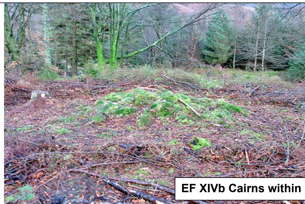
EF XIVb Cairns within recently harvested area