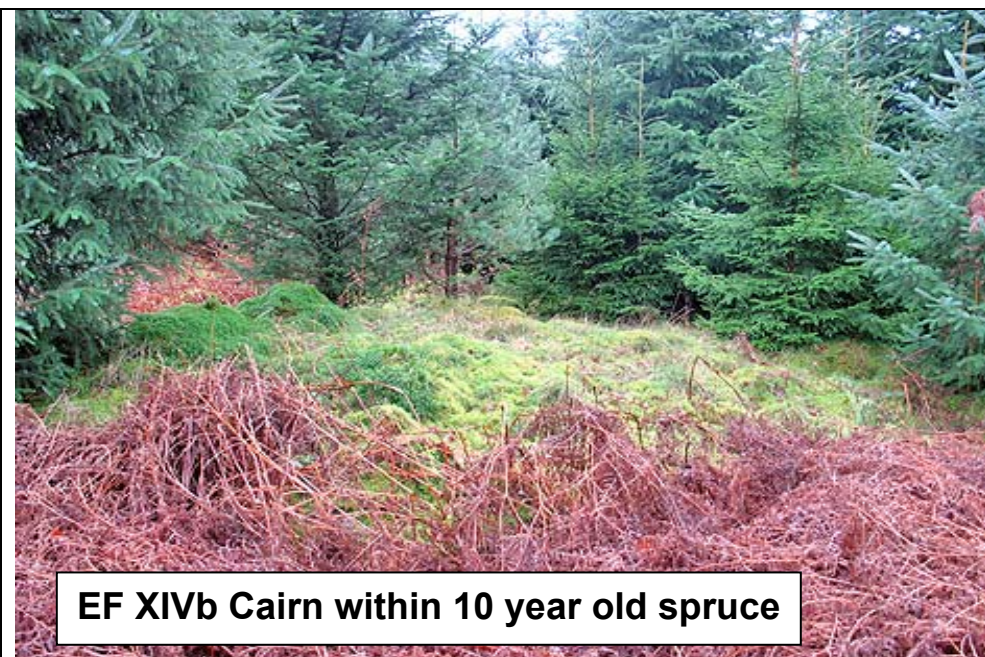
EF XIVb Cairn within 10 year old spruce