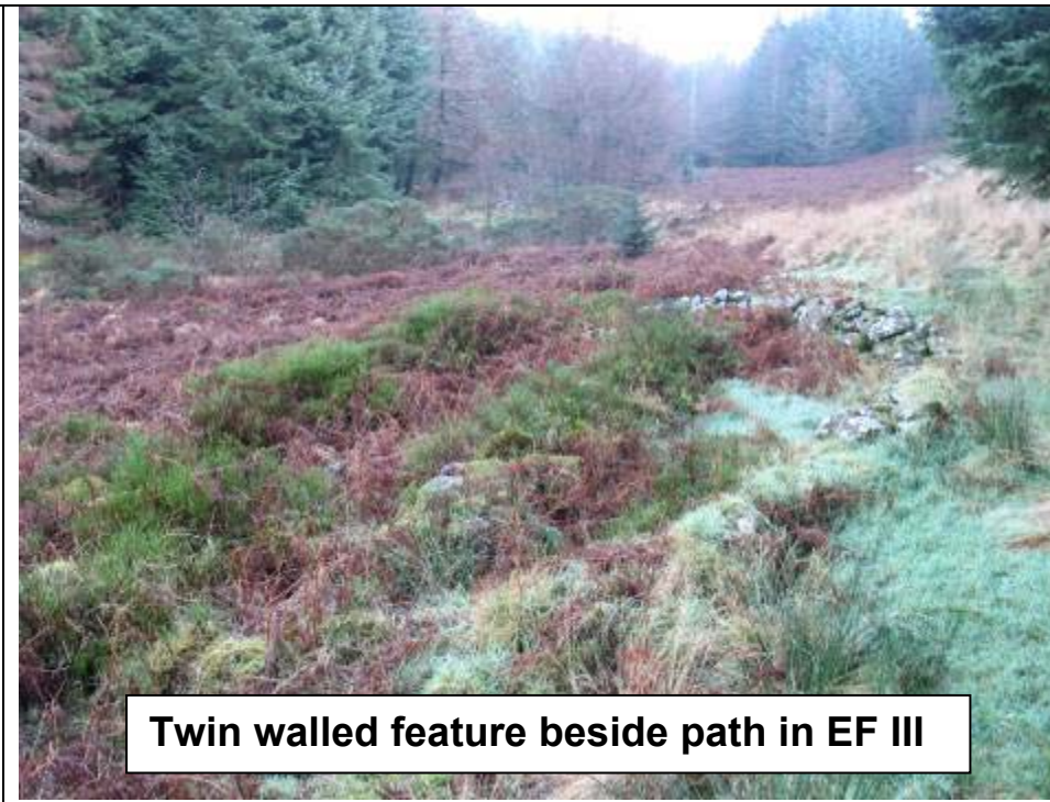
Twin walled feature beside path in EF III