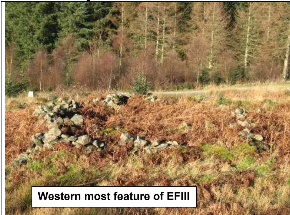
Western most feature of EFIII