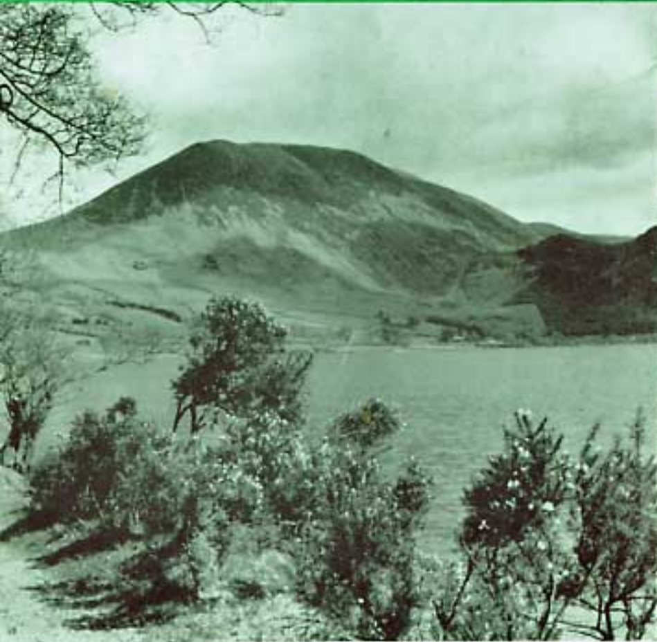
ENNERDALE LAKE AND HERDUS