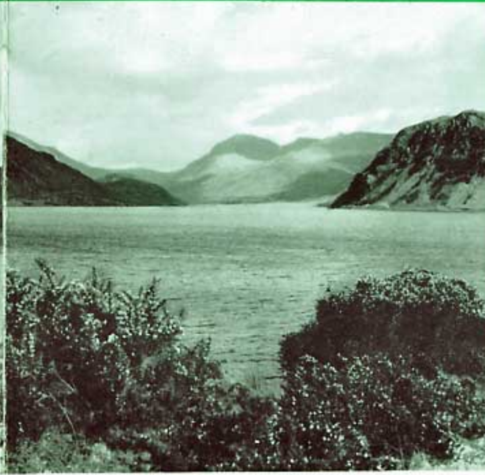
ENNERDALE LAKE AND PILLAR ROCK