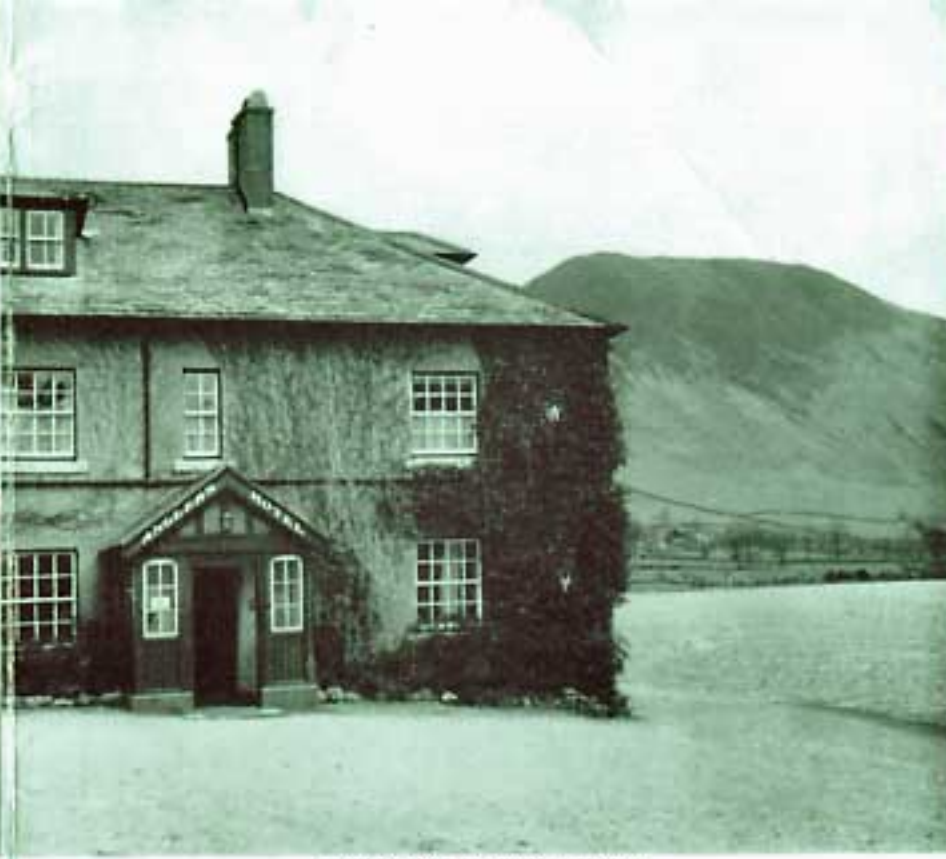
A CORNER OF THE ANGLERS INN