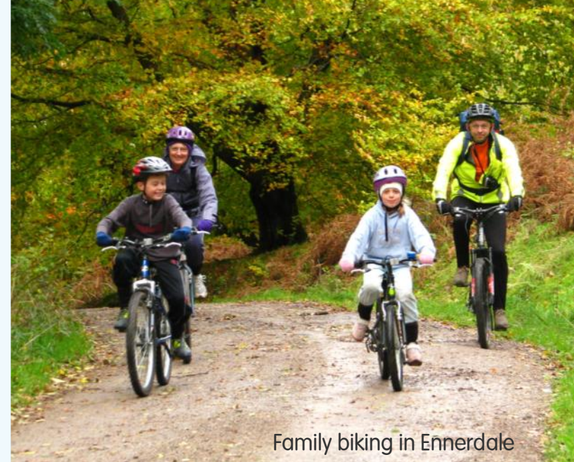
Family biking in Ennerdale