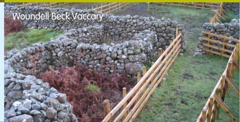
Woundell Beck Vaccary

Please Protect Our Wild Valley Don't start fires Protect and respect wildlife, trees and plants Keep dogs under control Take your litter home Make no unnecessary noise Take only memories away