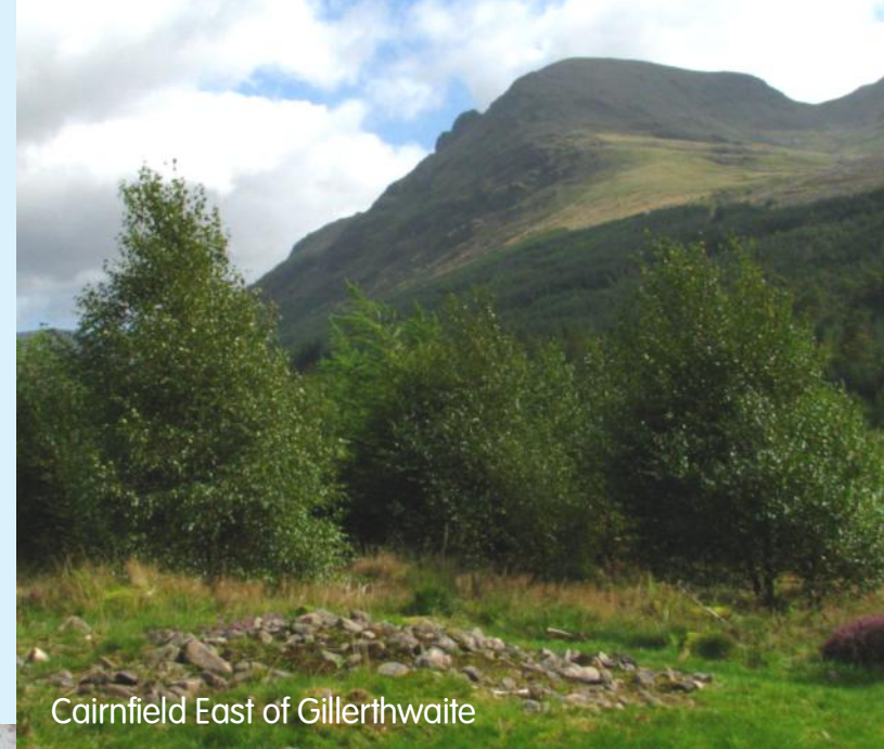
Cairnfield East of Gillerthwaite