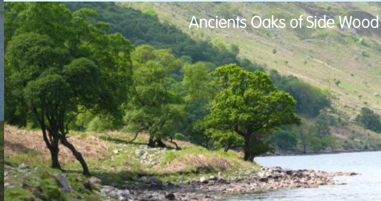
Ancients Oaks of Side Wood

Suitability. This is a low level walk along forest roads, tracks and narrow footpaths. The path surface along the south side of Ennerdale is rocky with many trip hazards and some sections that are regularly very wet. The climb over Anglers Crag is very steep and includes a short exposed scramble with a significant drop into the lake.