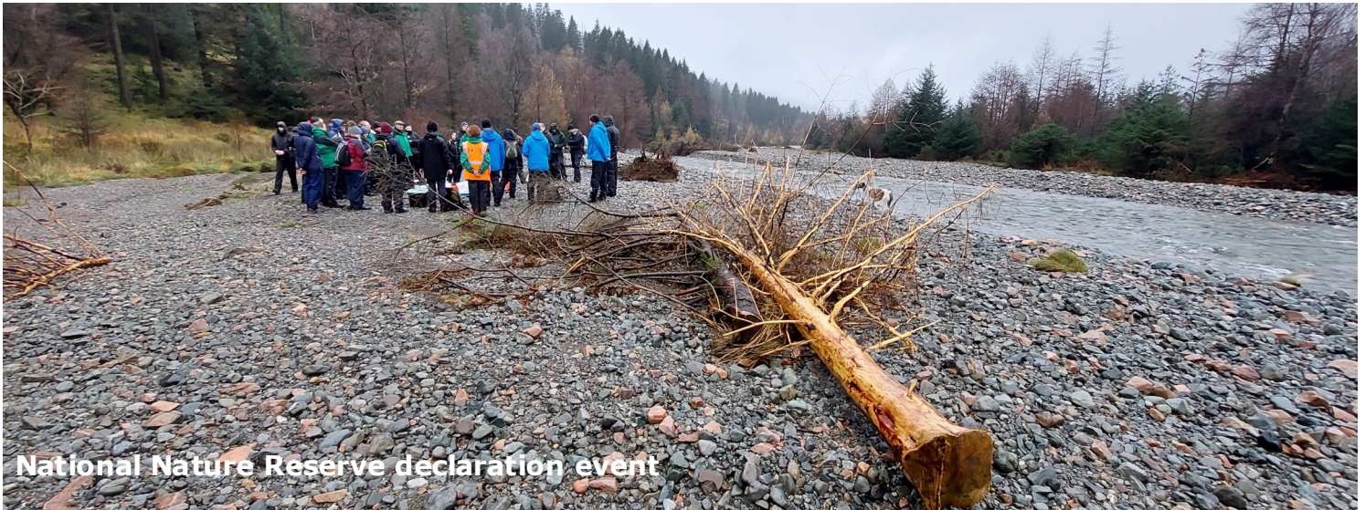
National Nature Reserve declaration event