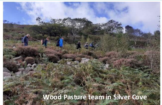
Wood Pasture team in Silver Cove

The Wild Ennerdale approach continues to be of interest to a wide range of groups and individuals. Most recently, staff hosted a team from the UKWWPN (Woodland & Wood Pastures Network). Wood pasture is defined as open grown trees with a species-rich ground flora and extensive grazing, usually by large herbivores (cattle or horses). The Silver Cove wood pasture was of interest in particular as it is young and structurally poor, but it is regenerating and is on an improving trajectory. Most of the wood pasture creation in the UK is occurring by planting – often in tree cages but in Silver Cove we have an example of creation by natural regeneration in a cattle grazed setting.