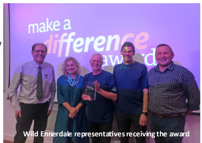
Wild Ennerdale representatives receiving the award

Wild Ennerdale team representatives were delighted to receive the award from Radio Cumbria and did so on behalf of everyone who supports the ongoing work in the valley.