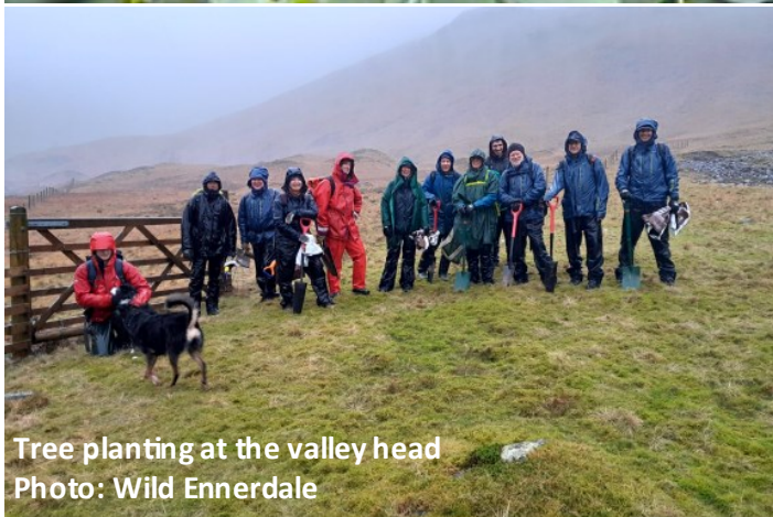
Tree planting at the valley head