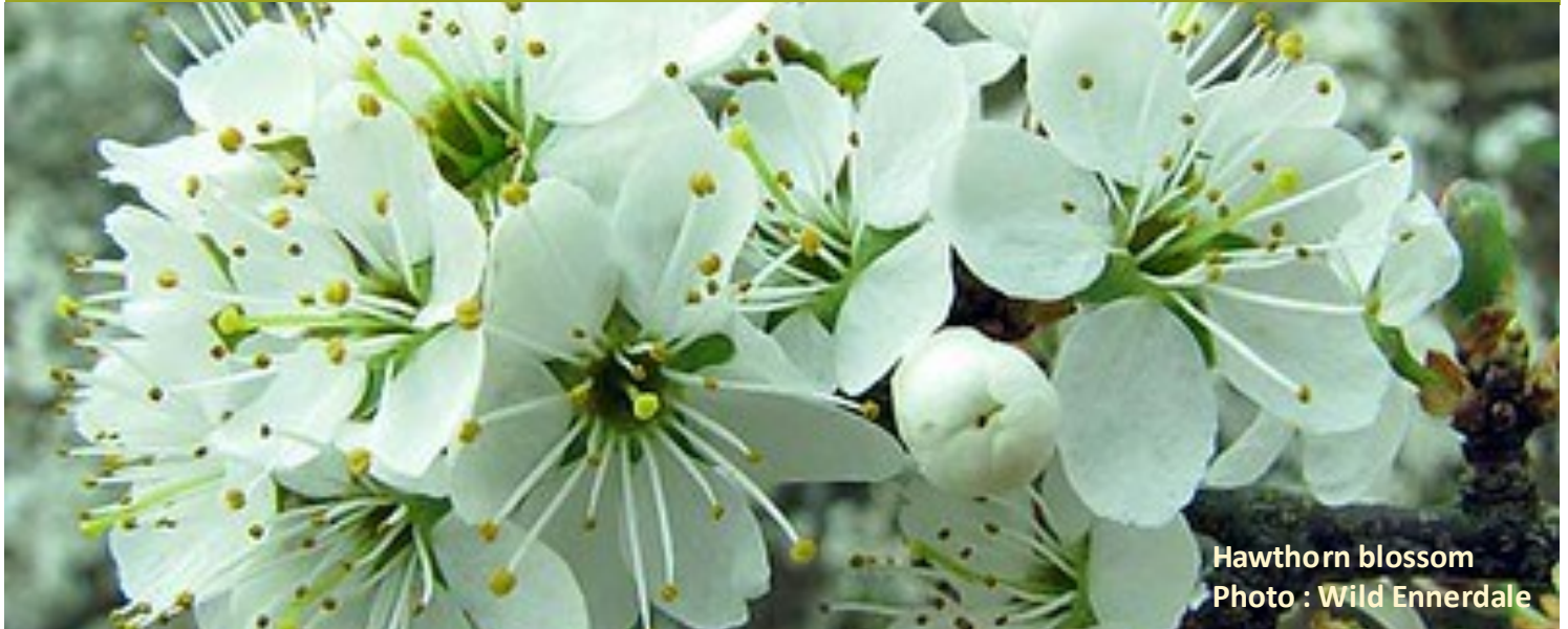
Hawthorn blossom